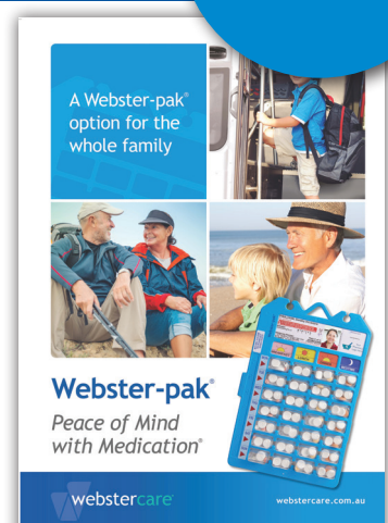
Webster-pak® Community for families