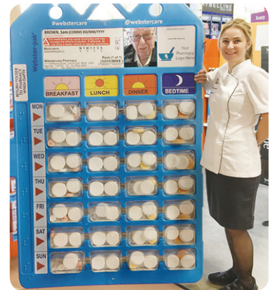
Inaloo Discount Drug Store

The enthusiasm has been great! Keep those photos coming and don't forget to tag @webstercare or hashtag #webstercare