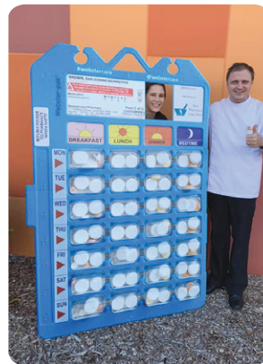
Wheatbelt Health Centre Pharmacy