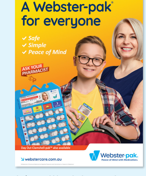
Code: A4 - 833B, A3 - 844B, A1 - 854B